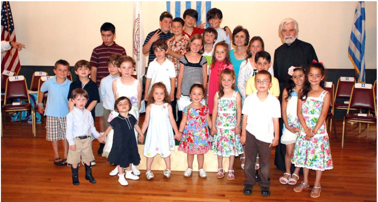
2009—2010 Protulis Greek School