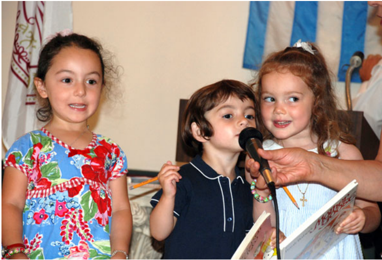
“Nipiagogeio” (Pre-K group)