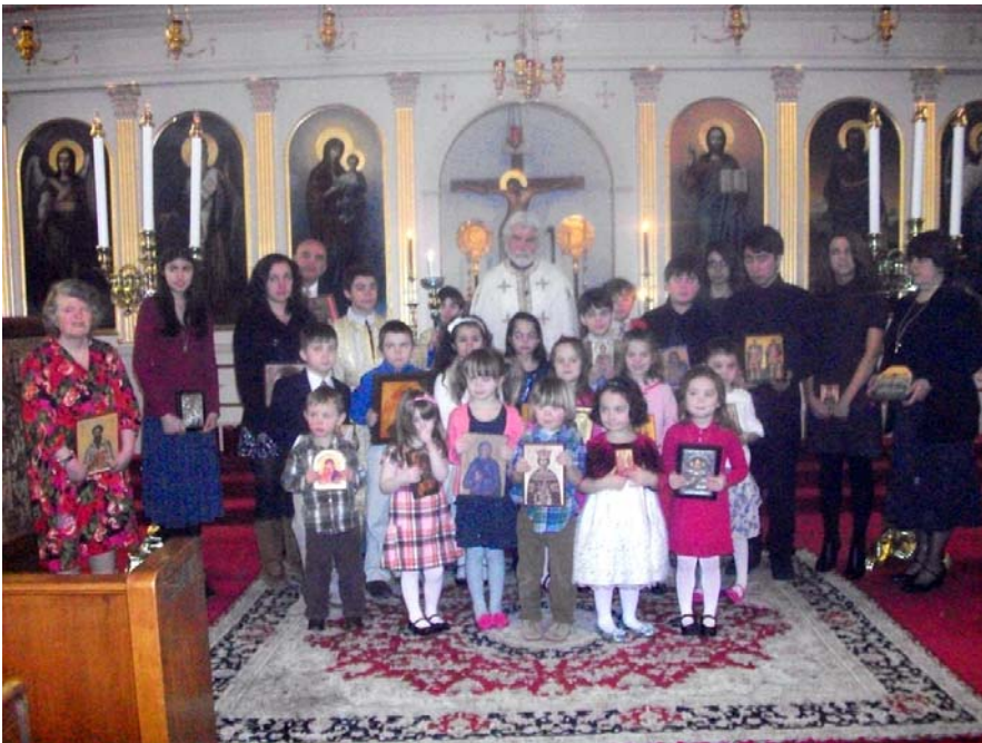
The children of our Religious Education participated in the procession of icons around the church for the Sunday of Orthodoxy.